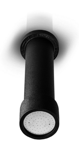
Note: UV radiation and extreme temperature can affect the color and structure of the JEE-O soho surface.